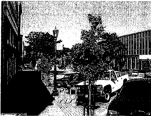
Newly Planted Tree

Several trees are currently being considered for removal this fall/winter and will be replaced in the spring of 2012. The replacement planting of trees removed this fall has been postponed due to the large number of trees being planted as part of the Ash Removal and Canopy Restoration Project currently taking place.