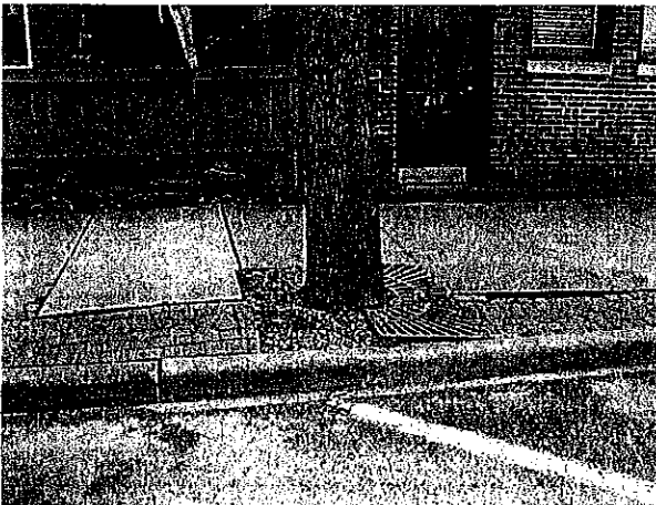
Pear on N. Water St