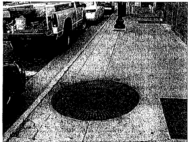
Vandalized Planting Site