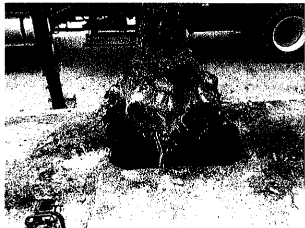
Pear in front of Mill

I will be glad to supply more information if needed and answer any questions that may arise.