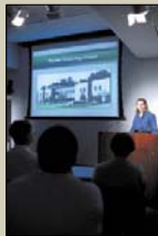
Professional Conference Facilities & Management with 2-Way Video