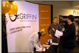
PRP Job Fair

High-Speed Internet & Purdue Connections