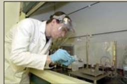
Specialized Laboratory Facilities