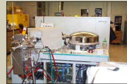
Purdue Equipment Access